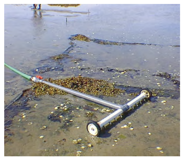
Figure 4. Hydraulic rigs are used to harvest softshell clams from subtidal waters.

in their shells, piled on a plate and ingested whole by the consumer, after removing the shells and tissue that surrounds the siphon. Commonly, clams are dipped in melted butter or other sauces before being consumed. Fried clams are shucked, breaded and deep-fried whole. Preferred size for steamed or fried clams is 63 to 76 mm SL. The edible portion of softshell clams (35% by weight) greatly exceeds that of other commonly consumed bivalve mollusks such as oysters (13%), scallops (18%), and hard clams (18%). Softshell clams are high in minerals, such as iron, zinc, magnesium, potassium, copper, and phosphorus. These minerals help build healthy blood cells, promote immune reactions, make proteins, promote muscular strength, healthy skin, and help build healthy bones. Twenty steamed clams without melted butter have 133 calories with 0.2 g of saturated fat, 23 g of protein and 60 mg of cholesterol.