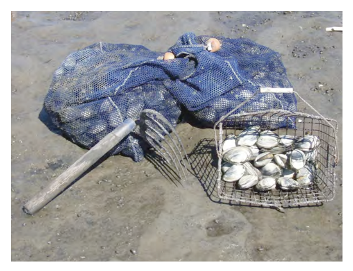
Figure 3. Softshell clams are harvested from intertidal waters by hand rakes and stored in bags for transport to wholesalers.

Softshell clams are marketed and consumed almost exclusively as a cooked product, either steamed or breaded and fried. Steamed clams are boiled or steamed