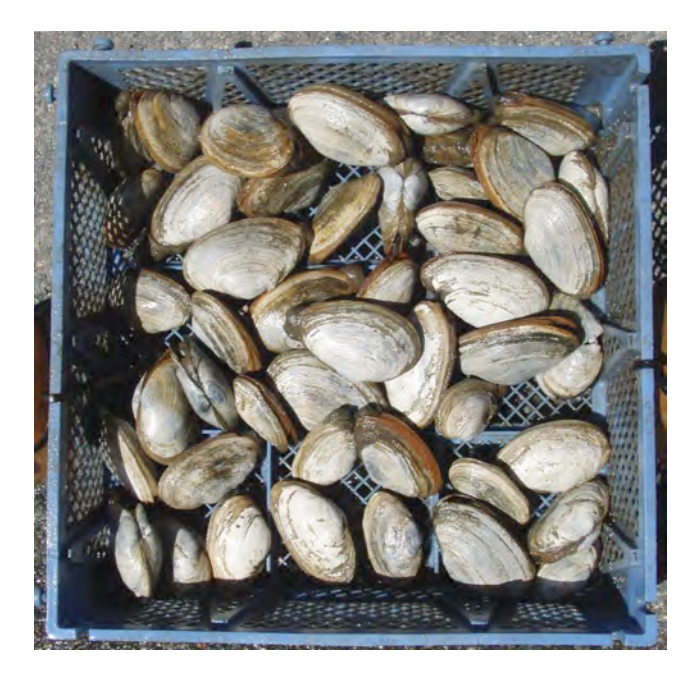
Figure 1. Softshell clams are typically white or gray and cannot close completely.

siphon extends through the sediments to the sediment/water interface. Cilia associated with the gills move oxygenated water with microscopic food, such as phytoplankton, bacteria and small organic particles,