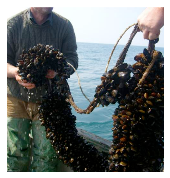
Figure 9. A mussel sock after deployment showing mussels that have emerged from the sock.

10) can be used. In this way the weight of the mussels is borne by either the socking pins or the socking collars at short intervals instead of the weight bearing down along the entire length of the socking tube.