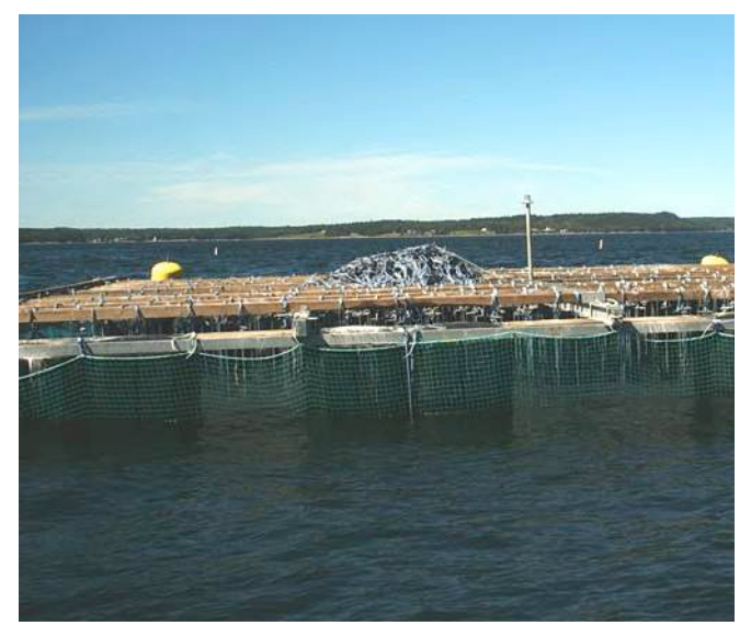
Figure 1. Mussel raft: 40 square foot, with some dropper lines visible under the platform.

Modern mussel rafts are constructed with steel Ibeam main frames, wooden crossmembers, and large polyethylene floats. Most measure 40 feet square and are capable of supporting up to 400 droplines of roughly 45 feet-long each (Figure 1). Roughly 40,000 lbs. of mussels can be reasonably expected in an 18-month cycle from seeding to harvest. Raft systems are most appropriate for reasonably protected areas, in fairly shallow water. They have the advantage of providing a stable work platform, and the disadvantage of being susceptible to damage from heavy weather (Clime and Hamill, 1979).