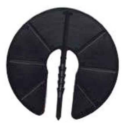
Figure 10. A typical mussel socking collar or anti-sloughing disk that is made of polypropylene plastic and is 20cm (8 inches) in diameter.