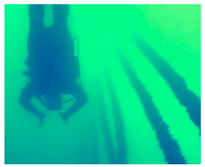
Figure 3. A diver inspecting dropper lines with mussels on a submerged longline system in New Hampshire.

Bottom culture is an approach that uses reduced densities of mussels on the sea floor to achieve high growth rates and a good meat-to-shell ratio. A producer may locate an appropriate site and seed small mussels on to it, or may find an established bed, and use a strategy of thinning and dispersal to grow the product. Careful site selection is especially important, as the influences of temperature, primary productivity, siltation, predators and other competing organisms can have great effects on the crop. Bottom culturists avoid the capital and maintenance costs of growout gear, but must spend extra attention to quality, and generally experience lower meat weights than suspension culture methods.