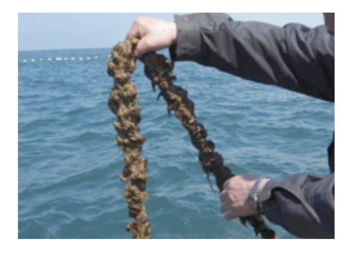
Figure 5. Freshly set mussels on a spat collector suspended from a floating longline.

One frequent question among those new to farming mussels is why the mussels cannot be simply left on spat collectors until they grow to market size. The answer is that mussel densities can be so high that they will be stunted because of competition for food resources, and if the set of spat is thick enough, the weight of the crowding mussels causes section or the entire mass of collected mussels to fall off and drop to the bottom. However, some of the seed 'dropoff' problem can be controlled by cross-pegging of spatlines (Figure 6).