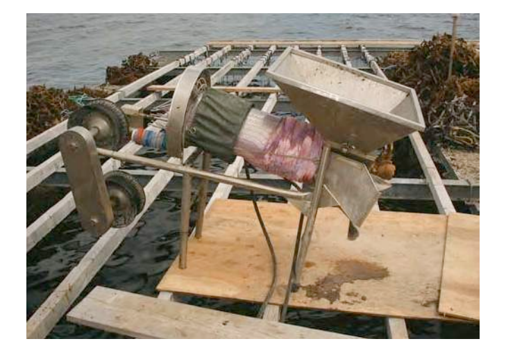
Figure 7. Mussel socking machine, manufactured by Aguin, used in mussel raft culture. Drop lines are fed under the hopper, and mussels are wrapped up against the line by cotton sheeting. The cotton sheet degrades, after the mussels have attached their byssal threads to the dropline.