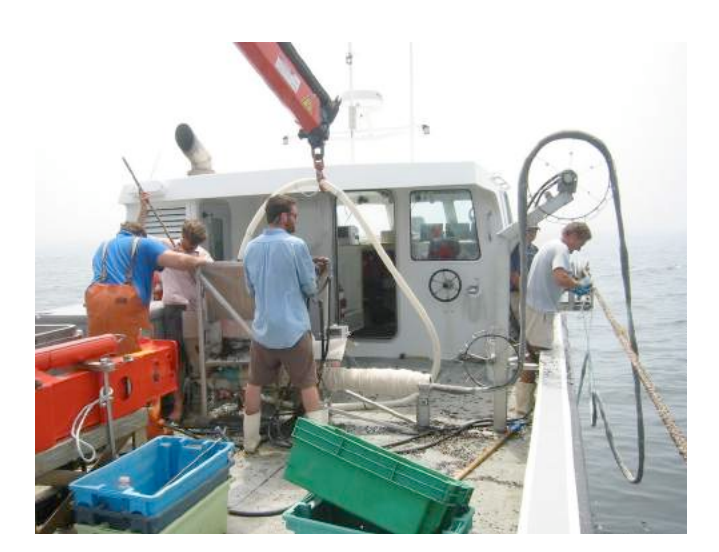
Figure 8. A shipboard continuous socking machine for seed socking of continuous longline droppers.

often use cotton socking or wrapping as socking material. Shorter drop lines can be created with the use of a socking table; essentially a hopper for seed mussels. At the bottom of the socking table is a pipe (the 'horn') of a diameter that snugly fits inside socking. Prior to placing mussels in the sock, a rope is inserted down the center of the sock to provide strength to bear the weight of the mussels as they grow. Mussels are then filled into the sock by running water into the socking table, which carries seed mussels into pipe and the sock, much as meat is forced into sausage casings in the sausage making process. For larger-scale mussel farming operations there are commercially available machinery to fill socks that can be in the hundreds of meters in length (Figure 8).