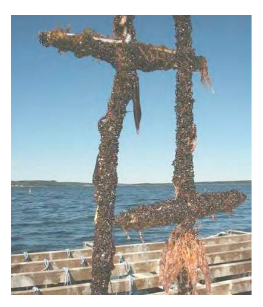
Figure 6. Mussel seed on raft drop line, with cross pegs still visible.

Discontinuous longlines, with drop lines of 4.5m (15ft) or so, most often use polyethylene socking, whereas the continuous longlines and mussel rafts most