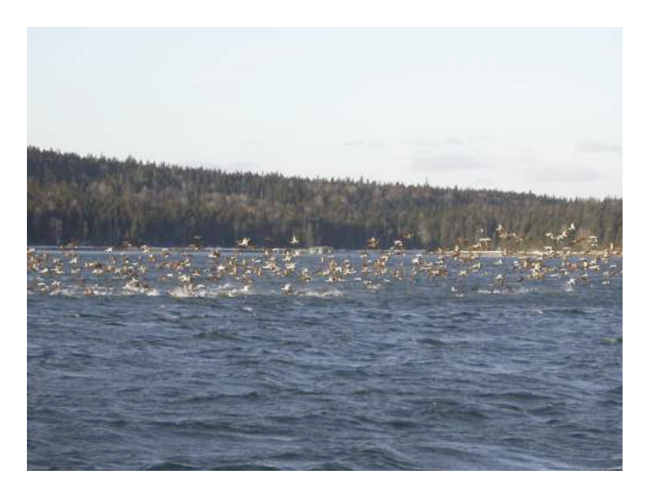
Figure 12. A group of Common Eider ducks – Somateria mollissima. An adult bird can eat over 30% of its body weight in mussels per day, and eiders often collect in groups, called 'rafts' of several hundred individuals.

Predation from diving ducks such as the Common Eider (Somateria mollissima) can be devastating to the mussel producer, certainly with the potential to wipe out an entire crop (Figure 12). Raft producers can use predator nets to surround the raft, whereas longline and bottom culturists cannot. The best control against duck predation is a personal presence by the farmer, to chase ducks away. Since a personal presence is often not possible on a daily basis, such as when weather does not allow it, producers may rely on a set of deterrents. Deterrents are best used in rotation and combination. Common approaches include the use of owl decoys, chasing the ducks off the site - sometimes using 'crackers' fired from a hand gun-like device, lasers (both over and under the water) or mooring an unmanned skiff on the farm. But the birds become accustomed to many of